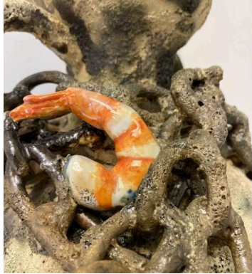
Ana Bessie Ratner (The Other Almanac), Protection Vessel #1 (Goody) , 2024, stoneware, glaze, Protection Vessel #2 (Lighthouse) , 2025, stoneware, glaze, black wash

Detritus, the stuff that's left behind and forgotten as we move on to something else is at the heart of these ceramic sculptures. Sometimes, it's unclear if the sculptures are doing the trapping or if they're being trapped themselves by these objects: air clips, thorns, worms, tassels, snap peas, chains, boiled shrimp, rope. Detritus is how archeologists understand what happened, the burnt remnants of the Bronze Age or the trash found after the destruction of Britannia, its data in material form.