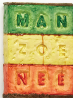
ManZoeNee (Artists Gotta Eat To Make Work), 2021 Marzipan, food coloring on board