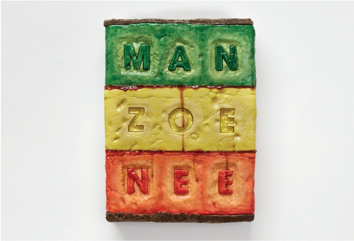
ManZoeNee (Artists Gotta Eat To Make Work) , 2021 Marzipan, food coloring on board