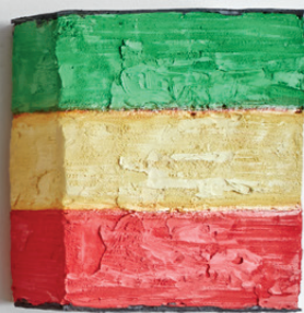
To The People of Bensonhurst (after FooGayZee Blinky Palermo), 2021, (Series of 4) Acrylic on board